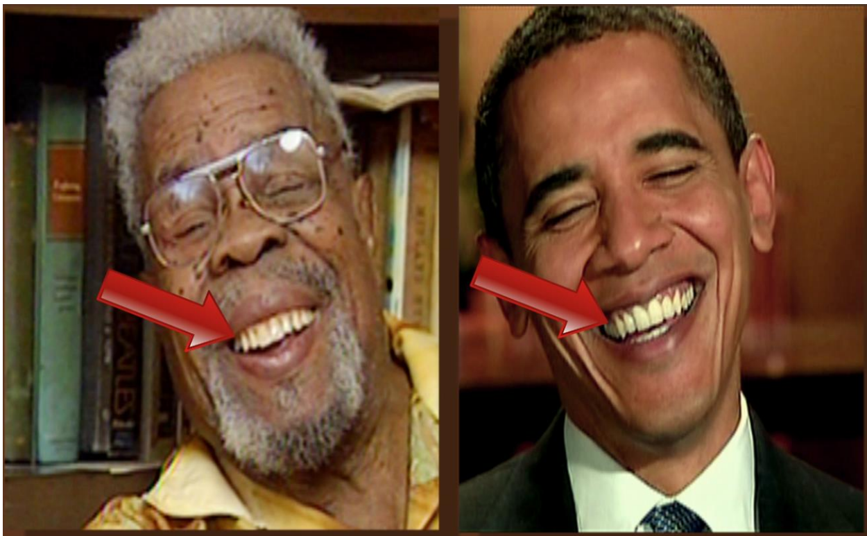
Frank Marshall Davis and Barack Obama

In his book on Vietnam, They Marched Into Sunlight , Maraniss mentioned that his father had been an editor at the Capital Times, and that “I had begun my journalism career there covering high school football games and writing movie reviews.”